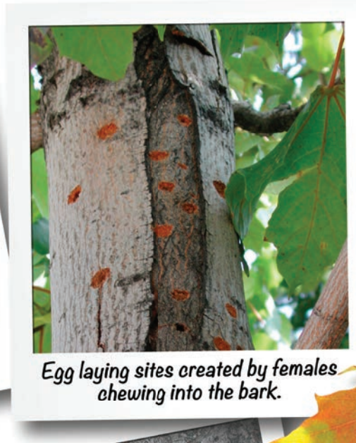
Egg laying sites created by females chewing into the bark.