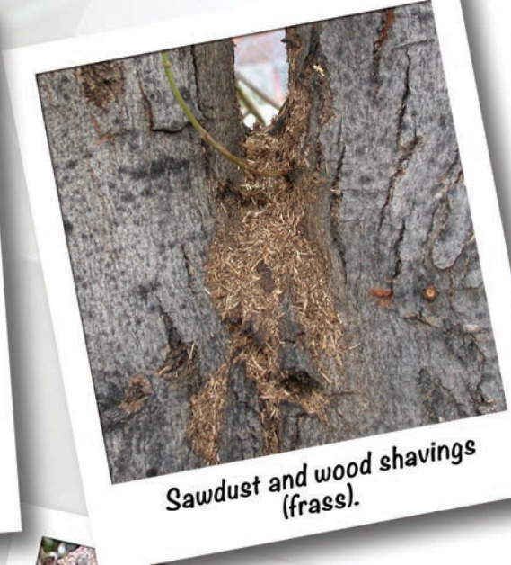
Sawdust and wood shavings (frass).