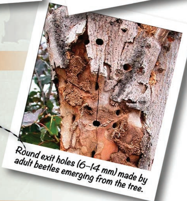
Round exit holes (6–14 mm) made by adult beetles emerging from the tree.