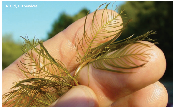
R. Old, XID Services

Flowers: Reddish flowering spikes, that emerge 5-10 cm above the water, contain small yellow flowers that have 4 petals. Flowers are alternate and attached directly to the stem.