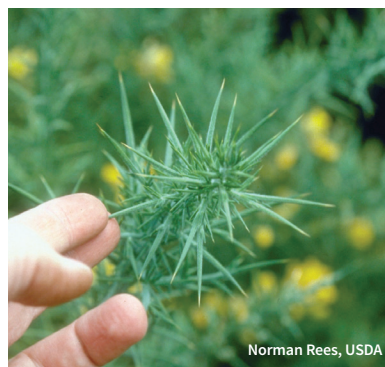
Norman Rees, USDA

Dispersal: Seeds are released explosively by the splitting pod. Seeds may land several feet away and can also be carried by water, animals, humans, machinery, and ants.