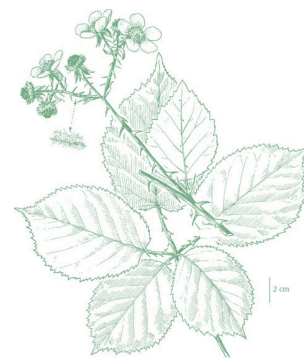
Rubus discolor

Habitat: Found on disturbed sites, along roadsides and right-of-ways, in pastures, along river and stream banks, freshwater wetlands, riparian areas, forest edges, and wooded ravines. Prefers rich, well-drained soils, but can grow well on a variety of barren, infertile soil types, a wide range of soil pH and textures, and is tolerant of periodic flooding by brackish or fresh water. Prefers full sunlight, but can survive in varied light conditions.