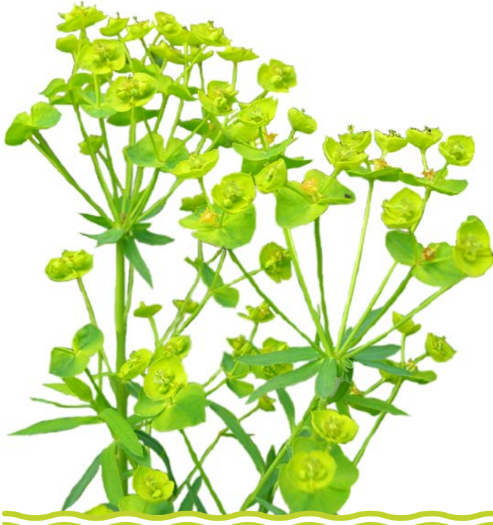
LEAFY SPURGE CUTOUT