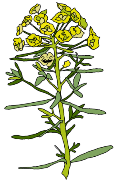
Leafy Spurge © Illustrated Flora of BC

Similar Native Species: Leafy spurge is often mistaken for Cypress spurge ( Euphorbia cyparissias ). Cypress spurge is shorter and less robust than leafy spurge. Leafy spurge has two subspecies and one hybrid subspecies. Euphorbia esula subsp. esula , Euphorbia esula subsp. tommasiniana , Euphorbia esula nothosubsp. pseudovirgata .