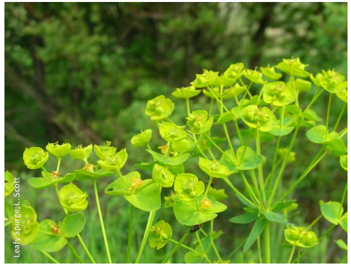
Leafy Spurge