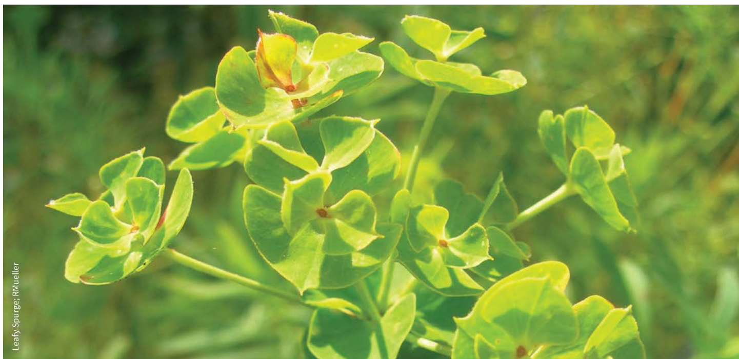
Leafy Spurge; RMueller

Application of herbicides on Crown land must be carried out following a confirmed Pest Management Plan ( Integrated Pest Management Act ) and under the supervision of a certified applicator. www.env.gov.bc.ca/epd/epdpa/ipmp/index.html