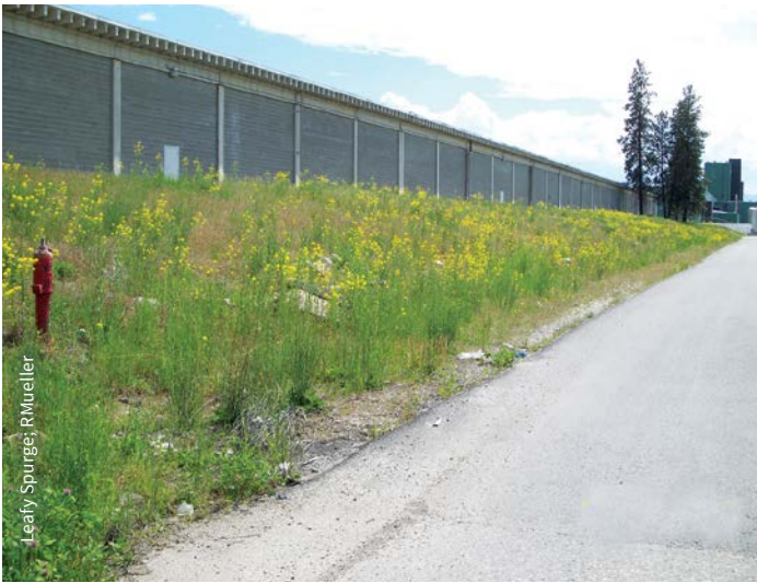
Leafy Spurge; RMueller