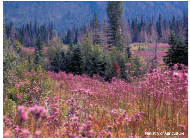
Ministry of Agriculture

A containment area has been established between Purden Lake and Valemount. Early detection and rapid response efforts should focus on locations outside of this containment area, which is mapped in the Invasive Alien Plant Program (IAPP) application.