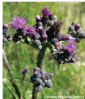
Cariboo Regional District

Similar Species: Distinguished from most other thistles by its single un-branched stem with spiny wings.