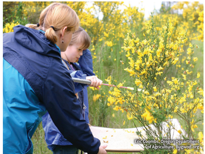
Eric Coombs, Oregon Department of Agriculture, Bugwod.org

Leaves: Stalked lower leaves are composed of three leaflets; un-stalked upper leaves are simple.