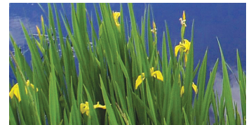
Yellow Flag Iris ( Iris pseudacorus )