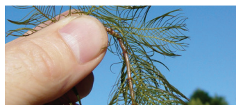
Eurasian Watermilfoil ( Myriophyllum spicatum )