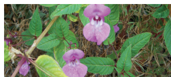
Policeman's Helmet ( Impatiens glandulifera )