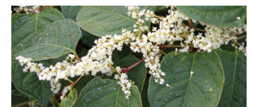
Knotweed ( Polygonum or Fallopia spp. )