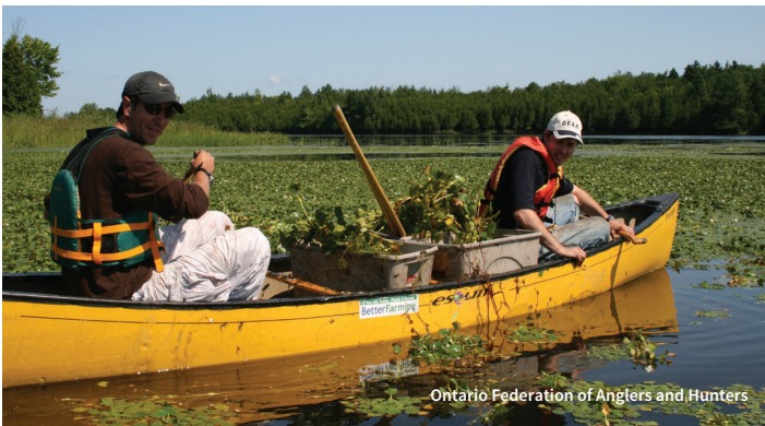
Ontario Federation of Anglers and Hunters

The term invasive plant, as used hereafter, includes provincially listed invasive plants and noxious weeds, as well as other alien plant species that have the potential to pose undesirable impacts on people, the economy, or the environment.