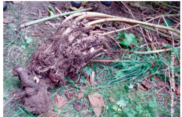
W. Pyrelli - Knotweed Roots

To move larger quantities of plants with soil attached from a regulated area, it must be taken to a landfill for deep burial. Contact the CFIA to obtain a movement certificate and contact a Vancouver Landfill for burial approval at least two days before your requested disposal date.