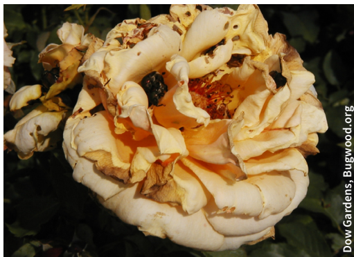
Dow Gardens, Bugwood.org